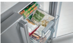
Freezer drawer - Independently controlled freezer zones

Additionally, the vacuum-sealed food can be used for sous vide cooking, which has many benefits, including retention of flavour, better textures and healthier results. Each SXS Deluxe includes 30 reusable vacuum bags.