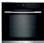
10 FUNCTION SINGLE OVEN