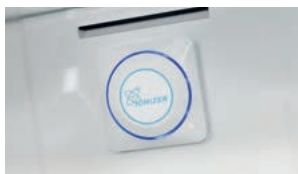
Ionizer™ - eliminates underlying odours