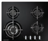
4 BURNER GLASS ON GAS HOB