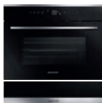
PREMIUM STEAM + WARMING DRAWER