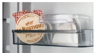
Odour seal box